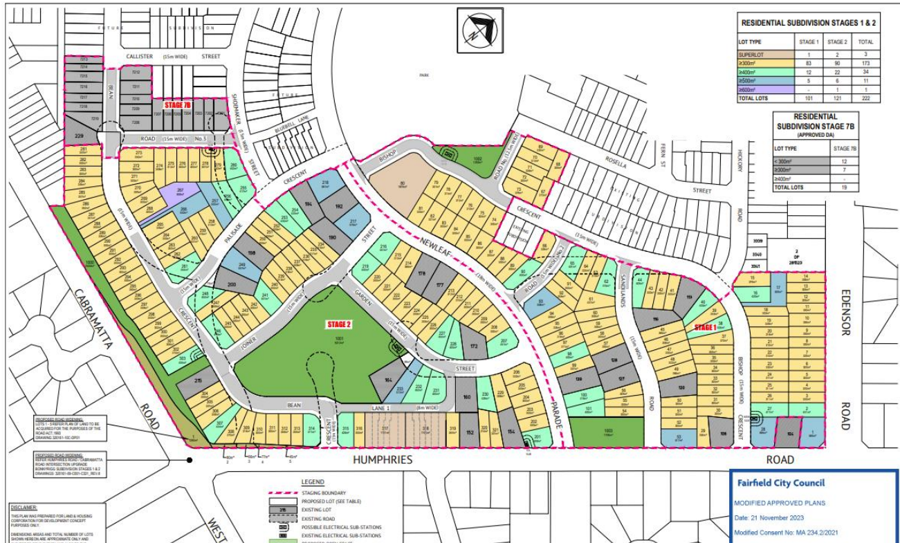
Figure 1: Stages 1 and 2 of the approved development along with the proposed roads to be built shown in grey and roads to be removed shown as dashed lines.

As part of these works, temporary 'No Stopping' restrictions will be installed on Newleaf Parade and Rosella Street to ensure two-way traffic flow can be maintained past the work area at the intersections and vehicles can turn around at terminating road ends whilst work is being undertaken.