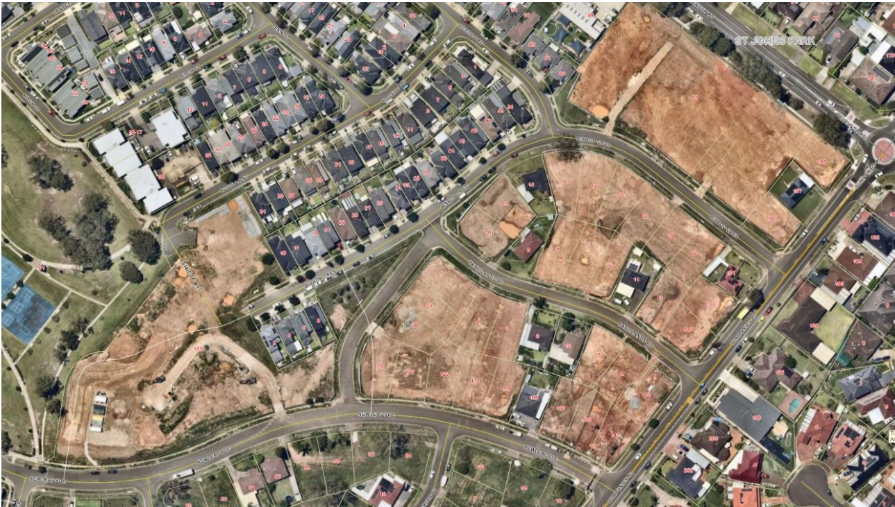
Figure 2: Aerial with recent earthworks showing privately owned lots.

As part of Phase 2 and 3 'No Stopping' restrictions will be installed on Newleaf Parade to allow for an unobstructed one-way traffic lane on Newleaf Parade between Humphries Road and Palisade Crescent. The 'No Stopping' applies on the side of the road traffic flow occurs. Newleaf Parade is to maintain an eastbound traffic flow in Phase 2 and 3 with westbound traffic diverted down Palisade Crescent.