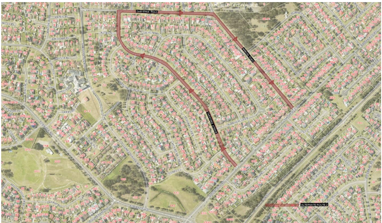
Figure 3: Detour 2 for the proposed full-time 'No Right Turn' restrictions at the Smithfield Road and Cherokee Avenue intersection. Additional distance is approximately 1.8 kilometres which is equivalent to around an increased 1.8 minutes of travel time.