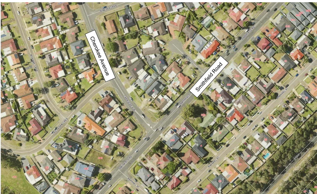
Figure 1: Intersection of Smithfield Road and Cherokee Avenue, Greenfield Park.

Cherokee Avenue is a local road that provides direct access to 338 residential properties and has a speed limit of 50km/h.