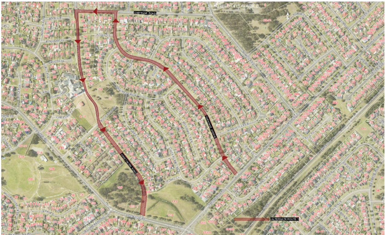
Figure 2: Detour 1 for the proposed full-time 'No Right Turn' restrictions at the Smithfield Road and Cherokee Avenue intersection. Additional distance is approximately 2 kilometres which is equivalent to around an increased 2 minutes of travel time.